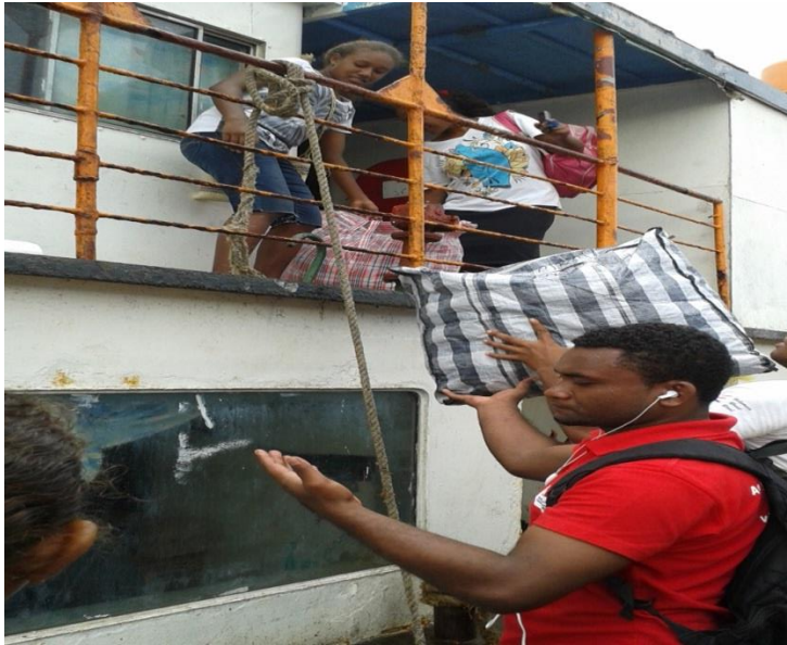
Figure 1: This photo depicts the items loaded on-board MV. Isabella destined for Alualu Village, Isabel Province.