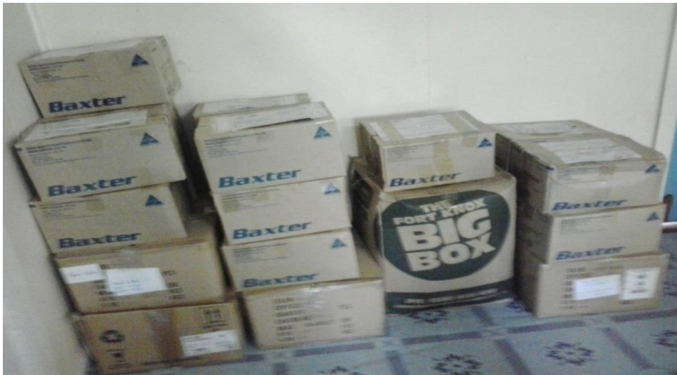
Figure 9: 20 cartons of utensils at my place

The items are not distributed yet due to absence of the school principal. He personally requested to receive the items so will hand over the utensils when he gets to Honiara.