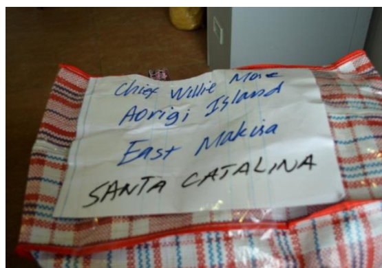
Items for Santa Catalina Island.