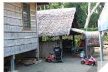
The Christian Crisis Centre