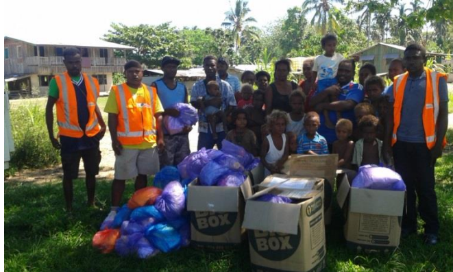
110 packages distributed at Old Selwyn College.

110 packages distributed at Old Selwyn College. The chief received the items on behalf of his people. Most of the villagers were out on the farms when we arrived to handover the items to the Village Chief.