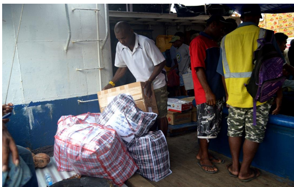
Items for the Highlands of Central Makira.

Brenda Kairoqo Koroni Cluster Group members distribution in Makira Province.